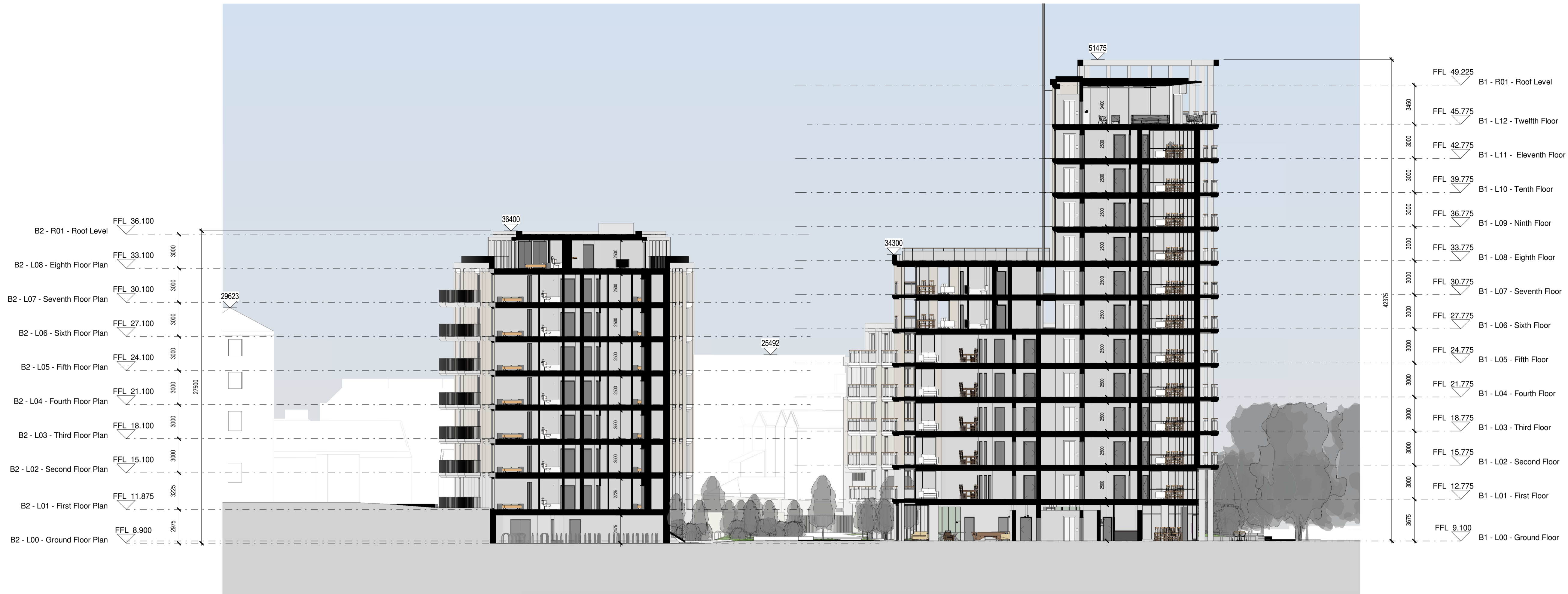
3 Section C-C 1 : 200

PL1 | 03.11.20 | BF | Issued for Planning